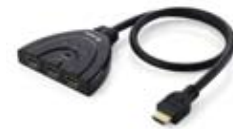
Multiple Sources Switch USB/HDMI/KVM Switches