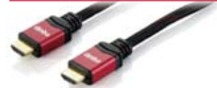
Video Connection VGA/DVI/HDMI/DisplayPort, 1m – 20m