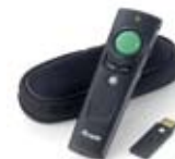
Presentation Gadget Multimedia Controller