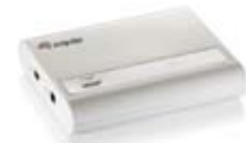
PC to TV Converter USB 2.0 to DVI/HDMI, 1080P