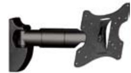
Flat Screen Mount 10" ~ 63" Fixed, Tilt and Swivel