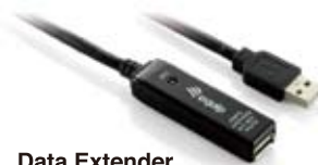
Data Extender USB 1.1/2.0/3.0, 5m – 45m